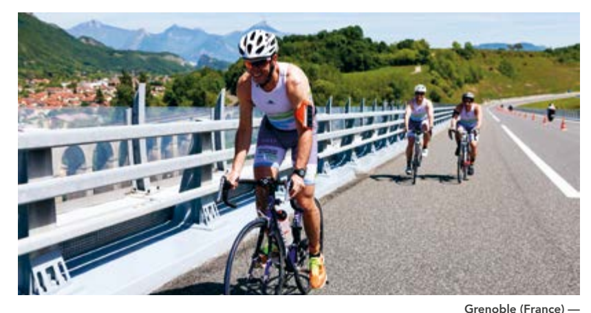
On May 21st 2017, APRR organised the Trièves Triathlon on a section of the A51 motorway closed to traffic.

Eiffage has always attached great importance to sport. Whether initiated spontaneously by employees or instigated by the Group, sport unites us around the shared goal of tackling challenges together and flying Eiffage's colours.