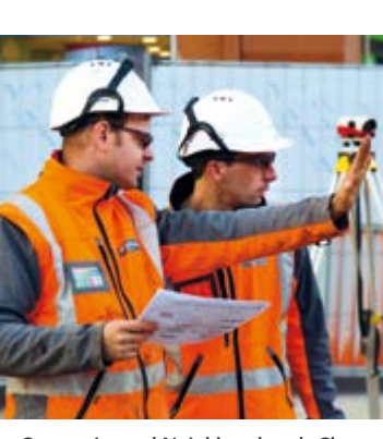
Companies and Neighbourhoods Charter -The integration of young people from disadvantaged neighbourhoods is addressed through a specific Group policy in the Companies and Neighbourhoods Charter.